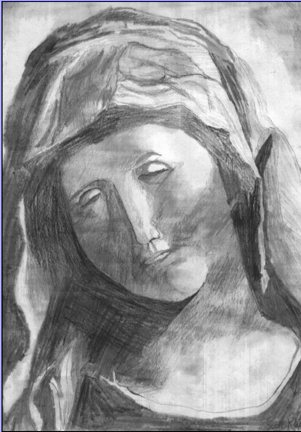
The Most Holy Trinity May 22, 2005